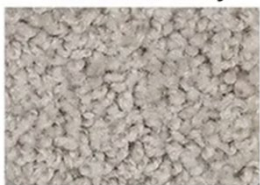
809 Silver Dollar