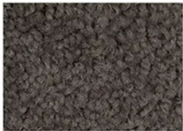
810 Dark Grey